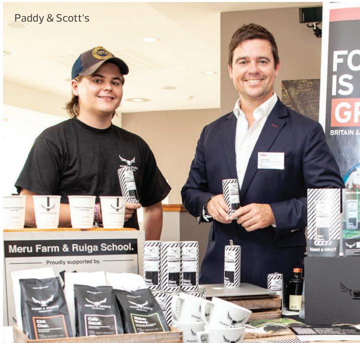
Paddy & Scott's